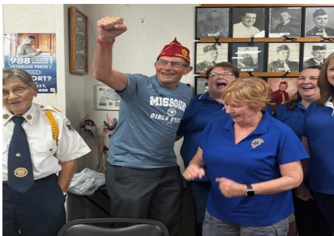
National Commander cheering with Girl State Staff during dinner at Post 287 in Savannah, MO