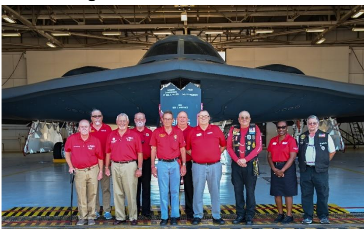
National Commander and the traveling party in front of the B2 at Whiteman Airforce Base.