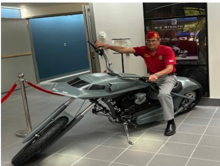
National Commander checking out a B2 Bike at Whiteman Airforce Base

Here are a few photos from the National Commander's visit. Please visit the Department's Facebook page for more photos.