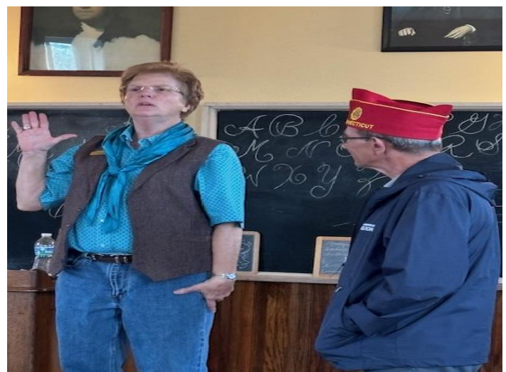
Touring the schoolhouse at the Pony Express Museum in St. Joseph, MO